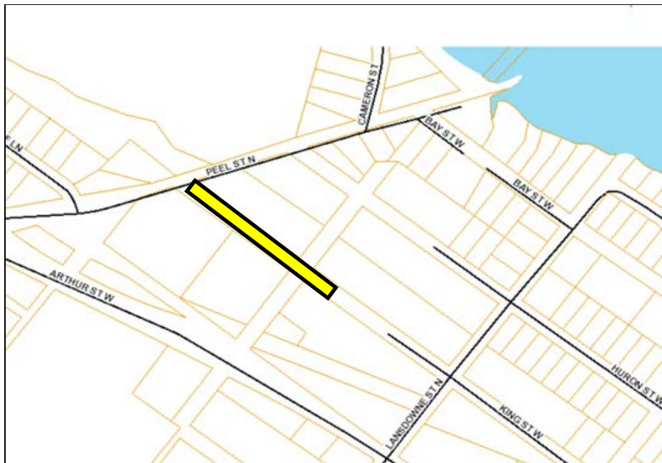
Figure 1 – Subject Portion of King Street West

It should be noted that in 2012 (EPW.12.092), Council deemed the lands described as the portion of the unopened Albert Street road allowance between the King Street West road allowance and the Georgian Trail and an adjoining block of land surplus to the needs to the Town however the lands have yet to be disposed. A depiction of those lands is provided in Attachment 2 labelled as Parts 1 and 2.