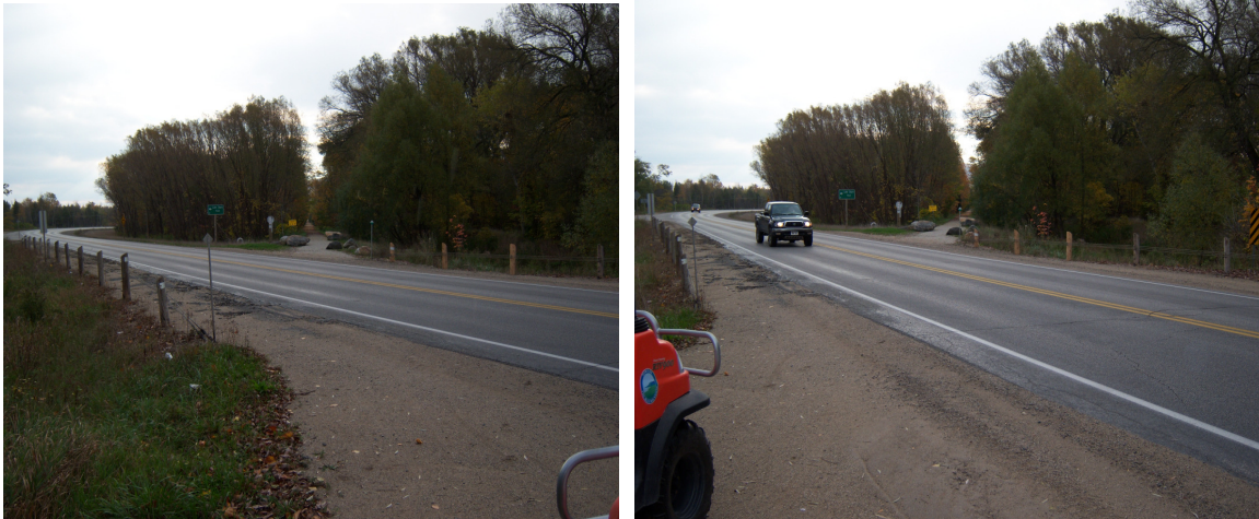
Intersection views toward Thornbury