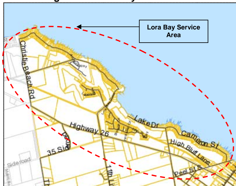
Figure #1- Lora Bay Service Area

Subsequent to the Phase II Report the Town retained Hatch Mott Macdonald (formerly AWS Engineers and Planners) to complete the engineering design for the required water and wastewater projects to service Phase 1 of Lora Bay (see Figure #1- Lora Bay Service Area). These projects included water servicing with a booster pumping station and reservoir located at the 10 th Line on Highway 26. Wastewater servicing would be provided by the Beaver River siphon, upgrades to The Mill Street Pumping station and wastewater collection from the 10 th line to the intersection of Huron and Victoria Streets in Thornbury.