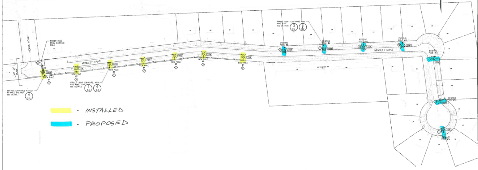
1 ELECTRICAL SITE PLAN - LIGHTING LAYOUT