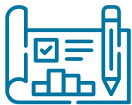
OFFICIAL PLAN UPDATE