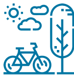
LEISURE ACTIVITIES PLAN