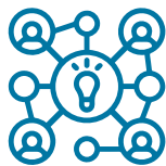
INTEGRATED COMMUNITY SUSTAINABILITY PLAN