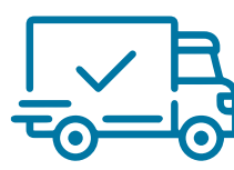
TRANSPORTATION MASTER PLAN