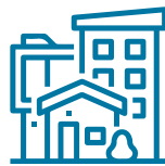
COMMUNITY IMPROVEMENT PLAN