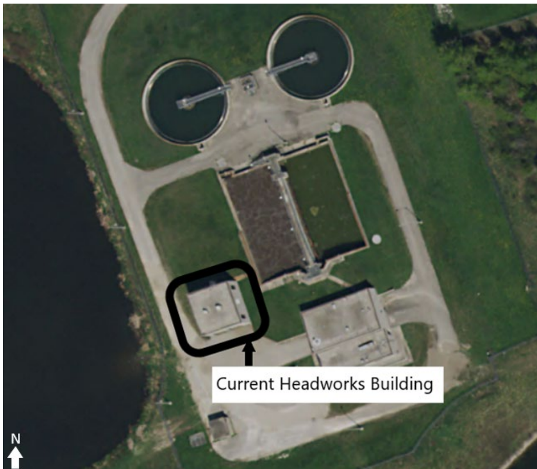
Image 2: Ariel Image of Thornbury Wastewater Treatment Plant, Mechanical System