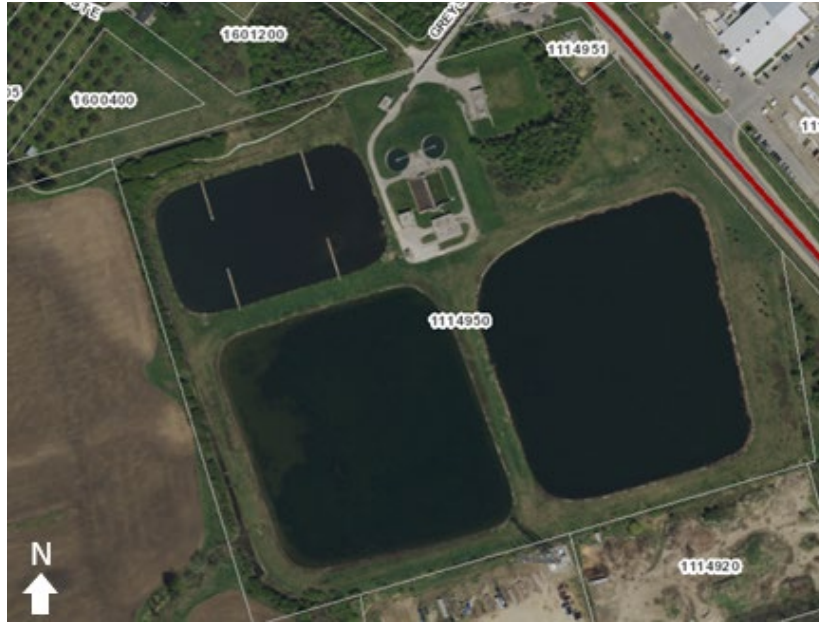
Image 1: Ariel Image of Thornbury Wastewater Treatment Plant and Lagoon System