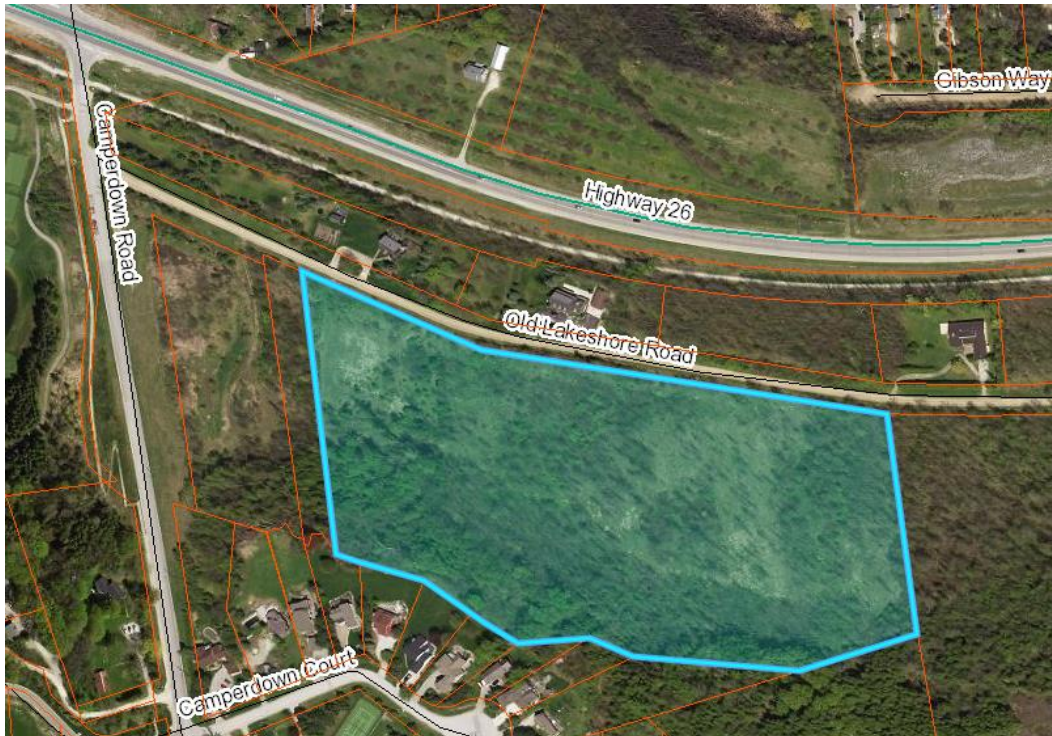
Map 1: Airphoto of Subject Lands