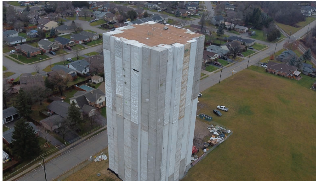
Example of scaffolding and shrouding installed as part of the lead abatement measures on a water tower rehabilitation project in Ingersoll, Ontario.

The abrasive blasting work to remove the existing primer and paint will require the installation of a full scaffolding structure and plastic shrouding around the entire water tower to facilitate the work.