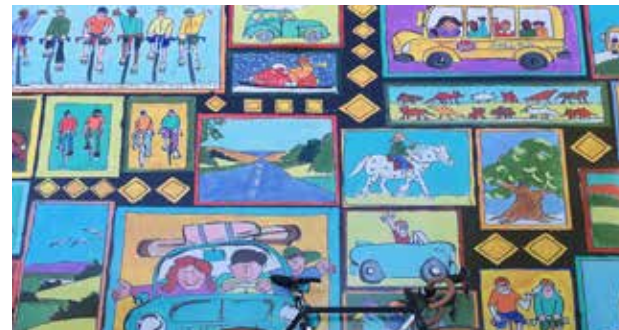
VILLAGES & HAMLETS