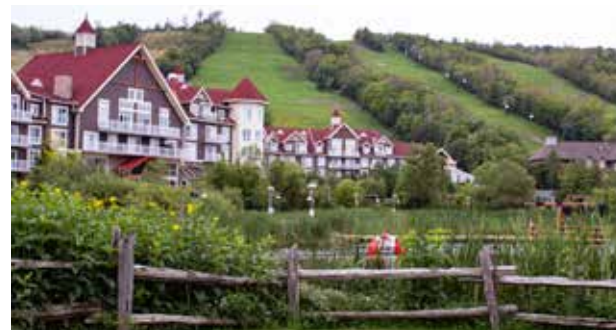
CRAIGLEITH & BLUE MOUNTAIN VILLAGE