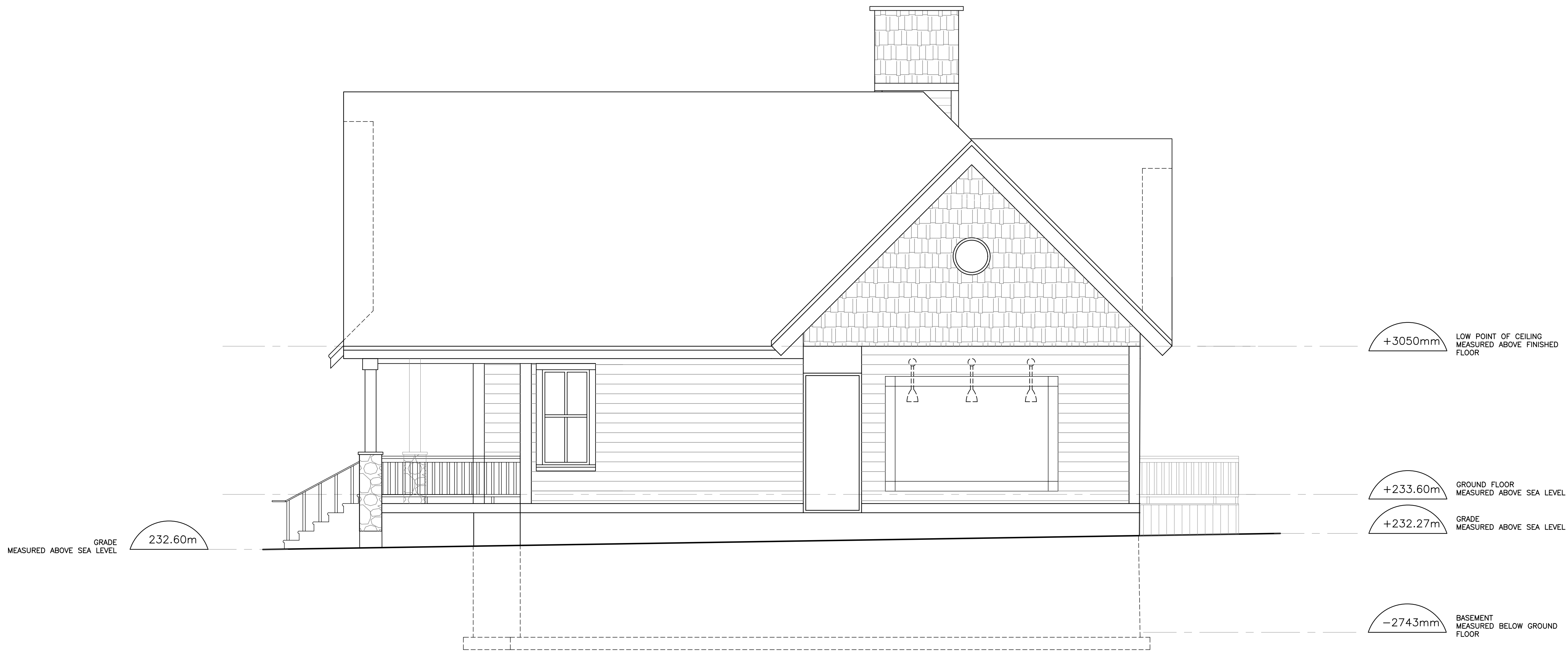
1 ARC BUILDING - EAST ELEVATION ID303 SCALE 1:50