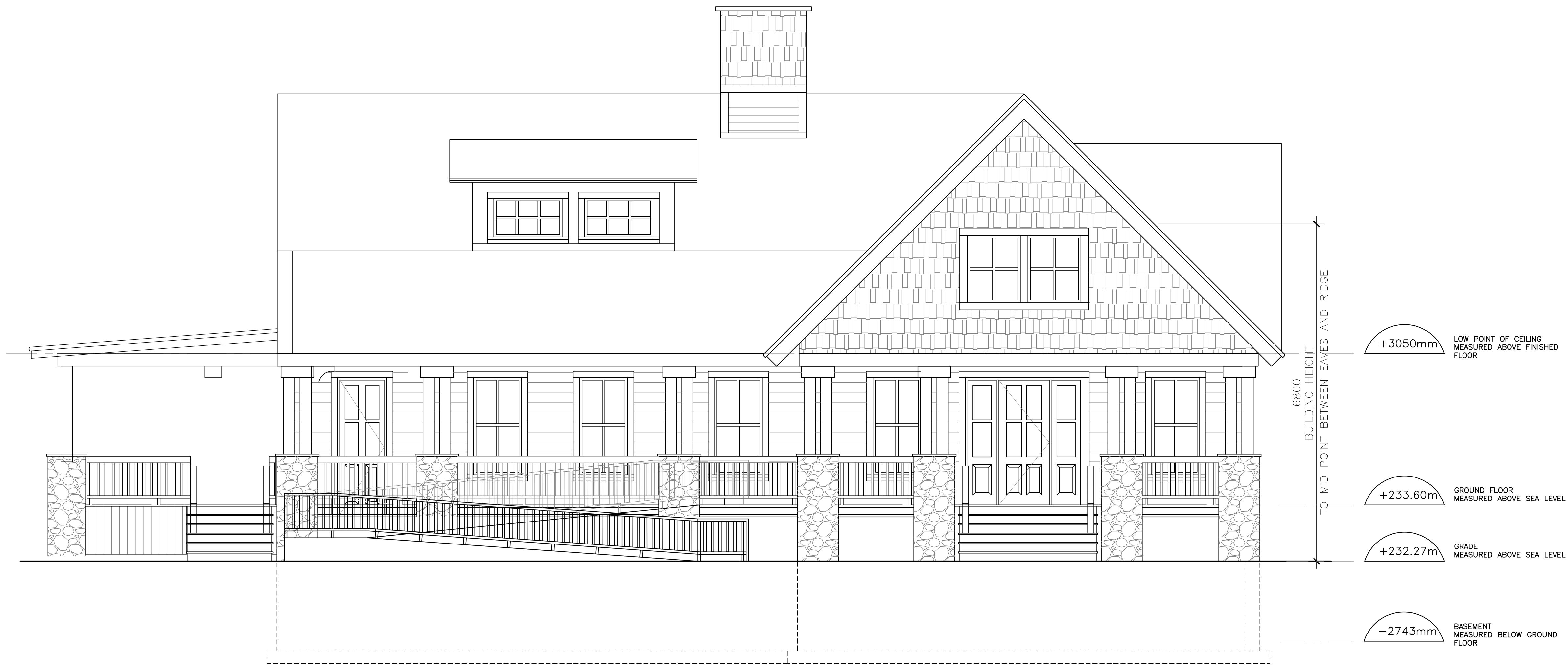
1 ARC BUILDING - NORTH ELEVATION ID301 SCALE 1:50