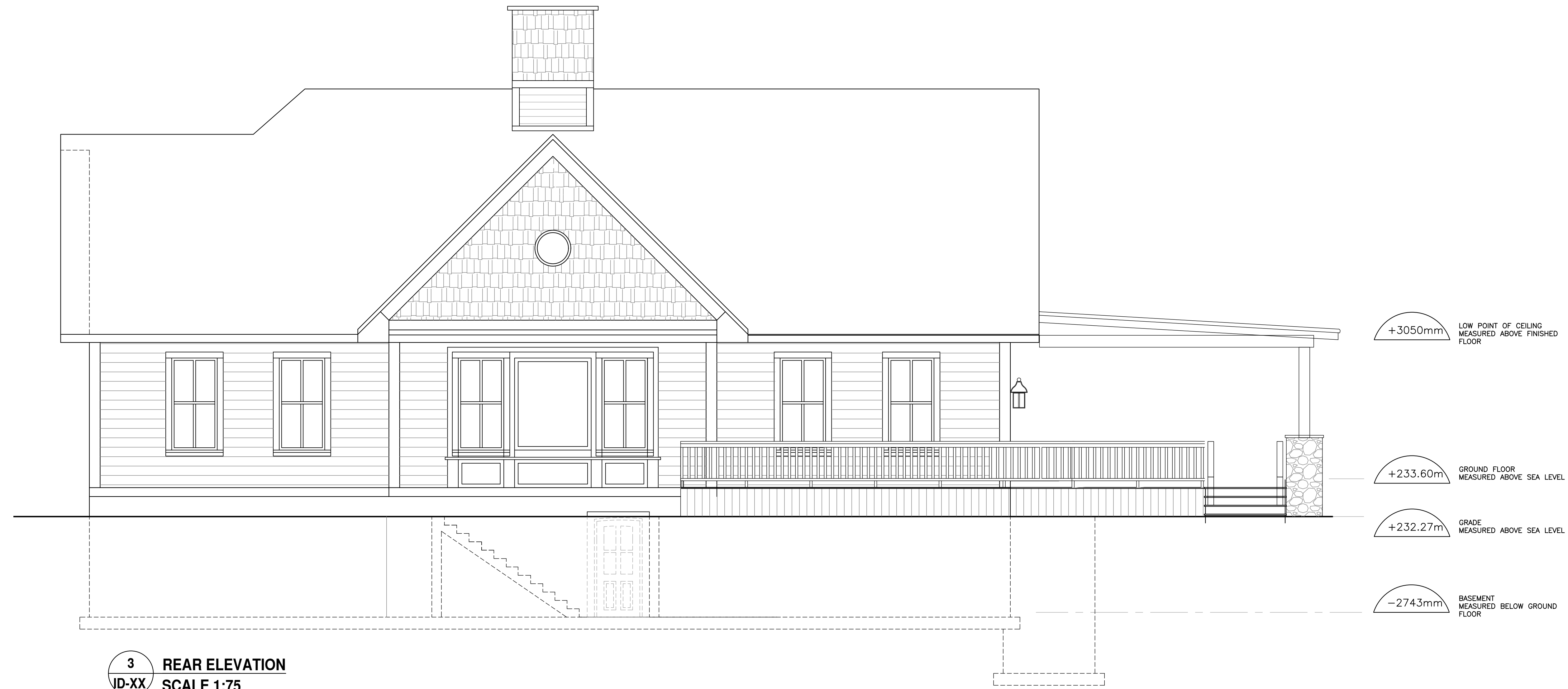
3 REAR ELEVATION ID-XX SCALE 1:75