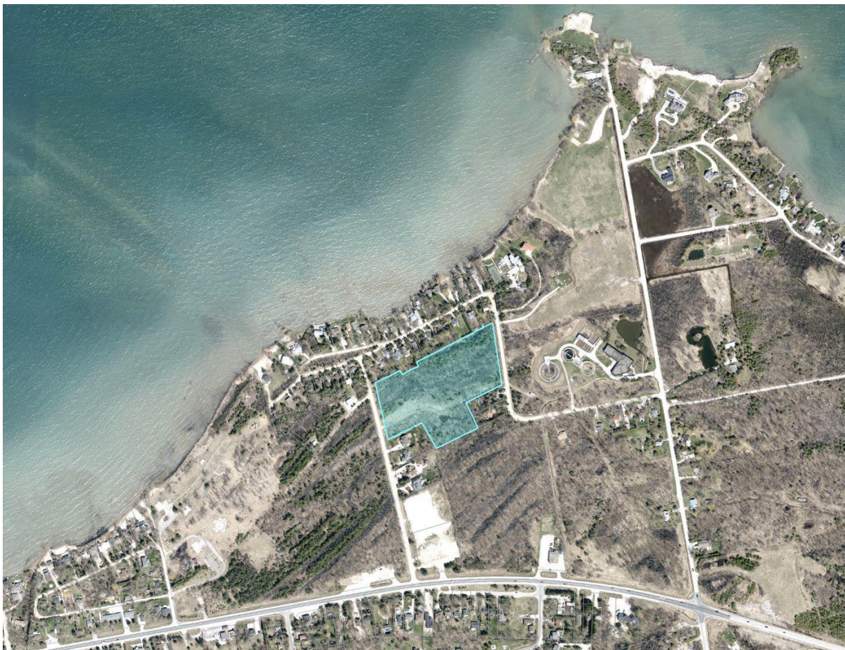
Figure 1: Air photo

The Town has previously supported the extension of draft plan conditions for this development.