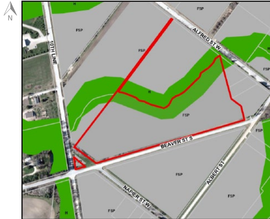
Future Secondary Plan